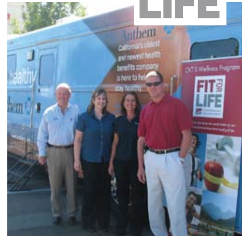
CVT and Anthem Blue Cross staff.

The bus was very well received throughout our member districts and along with the free health screening, CVT's vendor partners provided helpful information on wellness and preventative care. This was a pilot program offered by Anthem Blue Cross and we're hopeful we'll be hitting the road next year to visit select districts who were not able to participate this year.